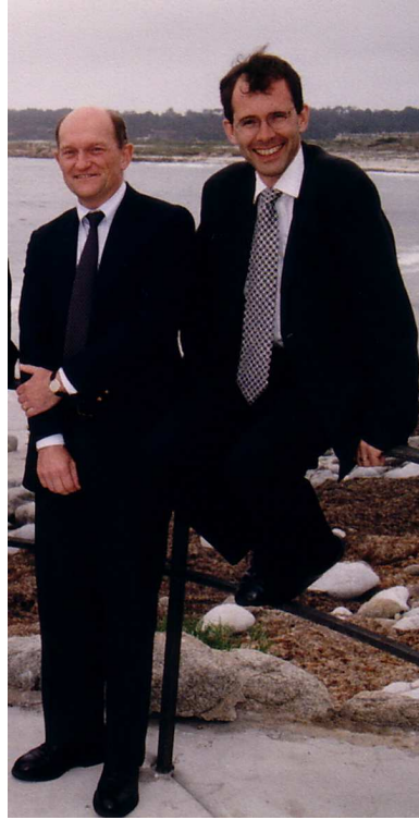
FIGURE 4. Gary Chamberlain and Guido Imbens in Monterey Peninsula, CA, 2002.